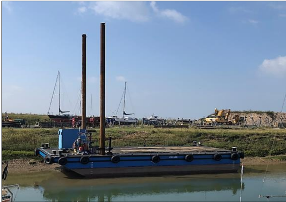
Figure 3 Spud Leg Barge

Works will be conducted over a two-day period and are expected to be completed by the 18 th July 2019.