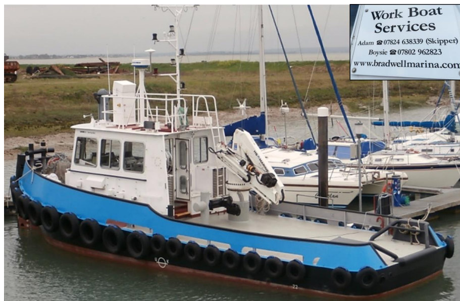
Figure 2 Jean T Work Vessel

Installation works will include the use of the Jean T work vessel and a spud leg barge towed into position. Each vessel is owned and operated by Bradwell Marina.