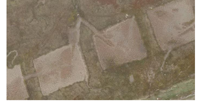
Figure 2, March 2018 after phase 1 works