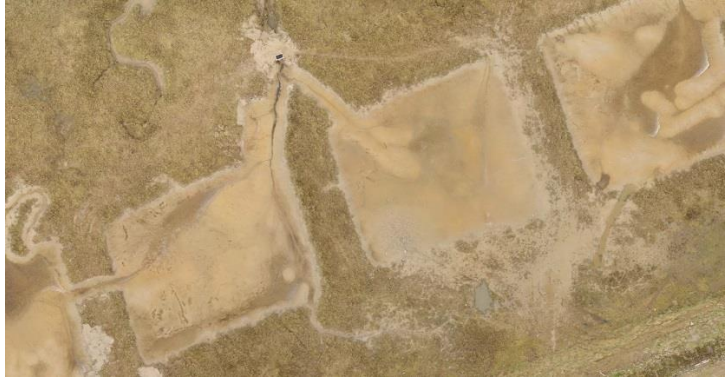
Figure 1, May 2017 before works

The USAR project as been an example (pilot) project that has put Brightlingsea on the map through the delivery of innovative methods and application of 'working with nature' and 'nature based solutions' believed to support the adaptation to climate change. Because of this Brightlingsea Harbour Commissioners have been commended by the Dutch 'Green Deal' and been named in relevant publications by PIANC and CEDA working groups. Work will continue on this exciting project, with a visit planned of the Thames Dredging Liaison Group in May.