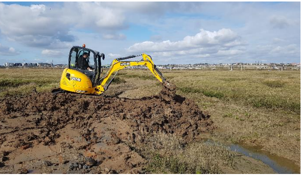
Figure 4, March 2020 repairs and additional works.

Figure 3, October 2019, colonisation with Samphire after one year.