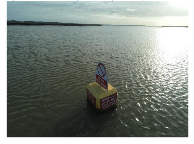
Figure 3: Current approx. location of buoys