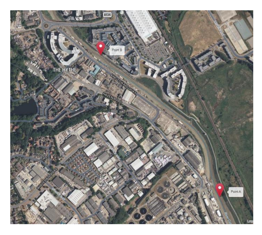
Figure 1: Point A and B in Colchester