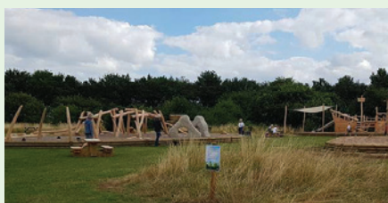
Mersea and beyond