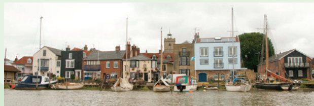
Brightlingsea to Wivenhoe pub lunch river cruise