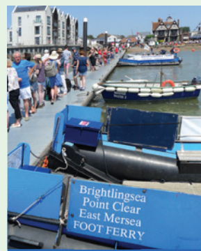
Ferry at B'sea Harbour